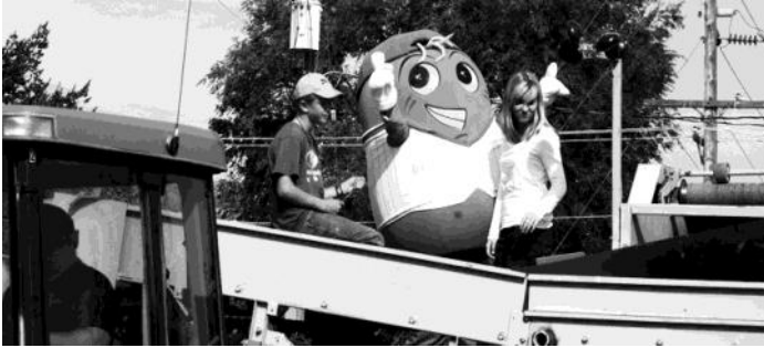
Rosso Bambino in the "Dig This" Potato Festival parade - Merrill,

R osso Bambino is the new OPC mascot that delivers a message for more than 120 commercial potato farms in Oregon that produce 2 billion pounds of potatoes each year.