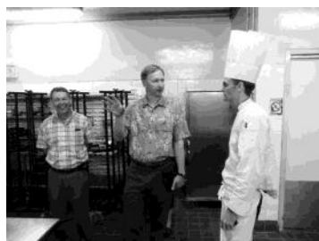
Kitchens at the Venetian Resort